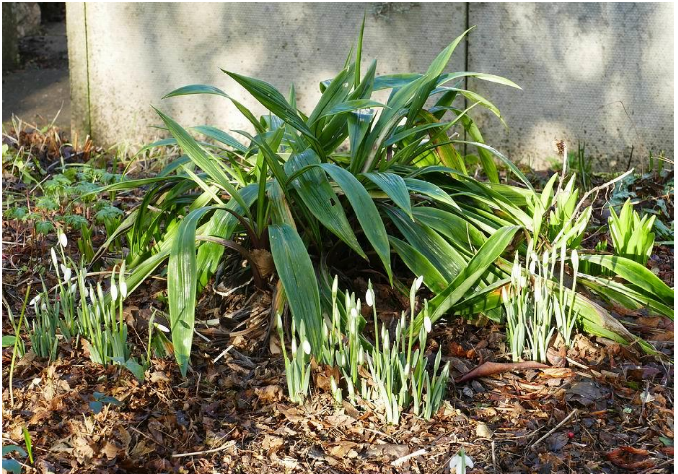
Celmisia mackaui surrounded by the emerging snowdrops and colchicum leaves.