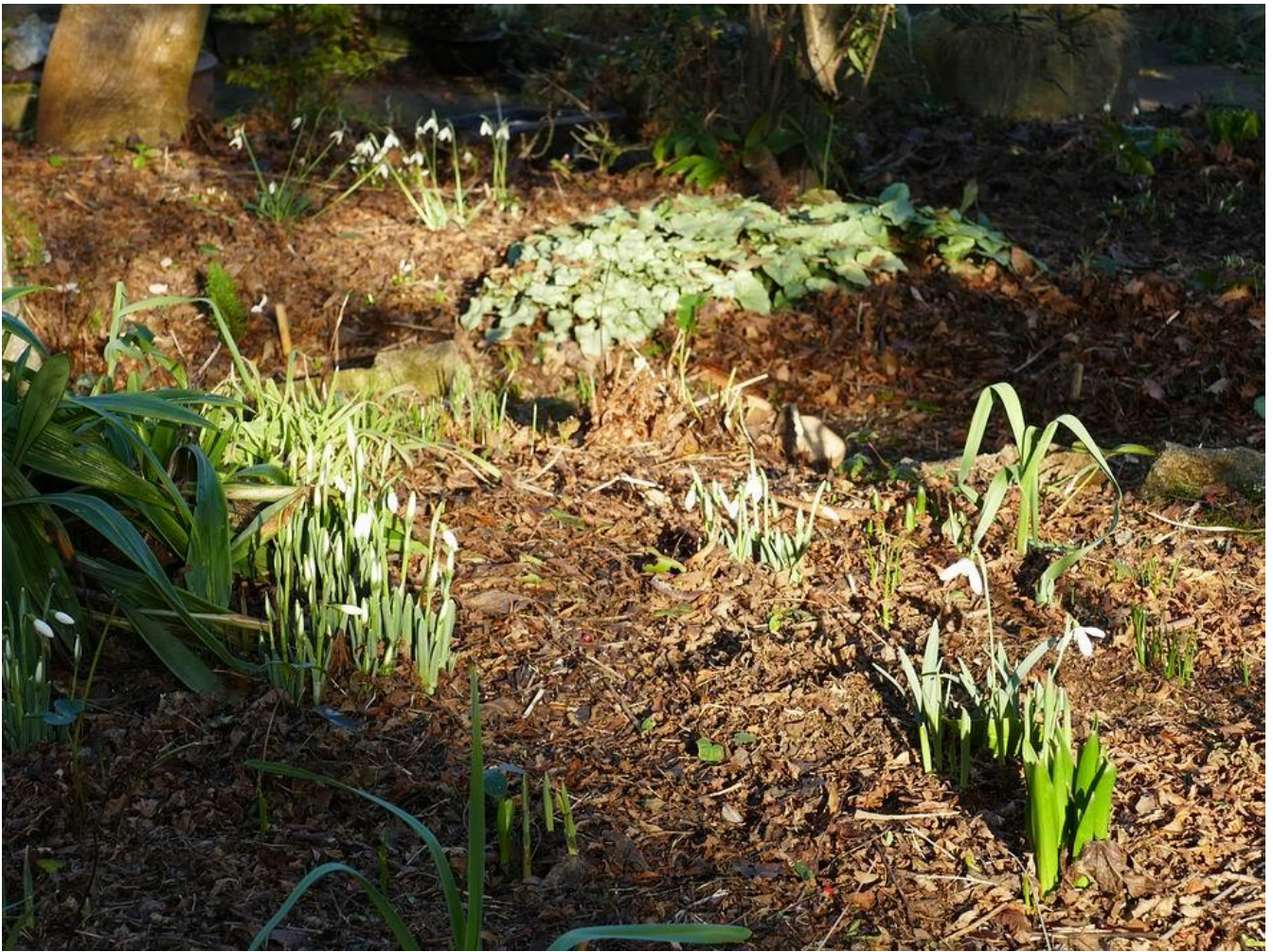
Cameras do not cope very well with such high contrast between the light and shade and as I walk past this bed I spot a small cluster of midges dancing in the mild air.