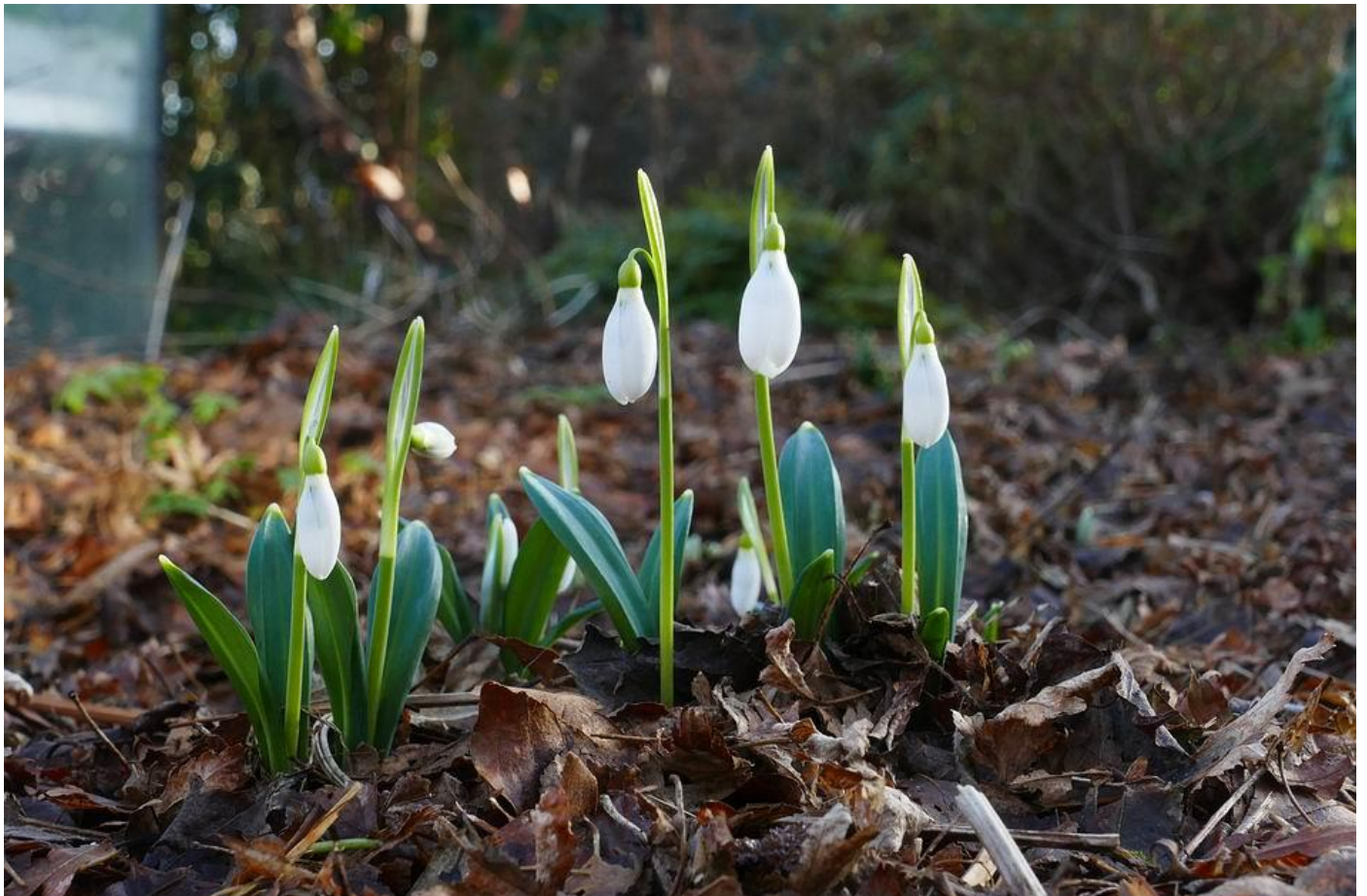
As I walk around I see more groups of snowdrops poking up through the natural mulches just as they might do in their native habitat.