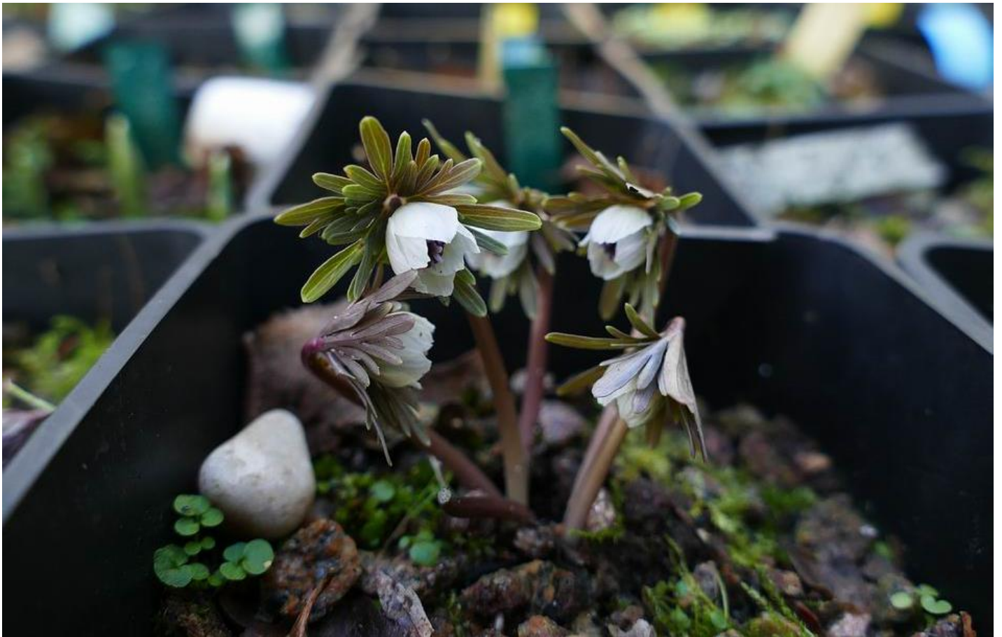
A quick check on the Eranthis pinnatifida as I walk past the frame shows their flowers are continuing to develop.