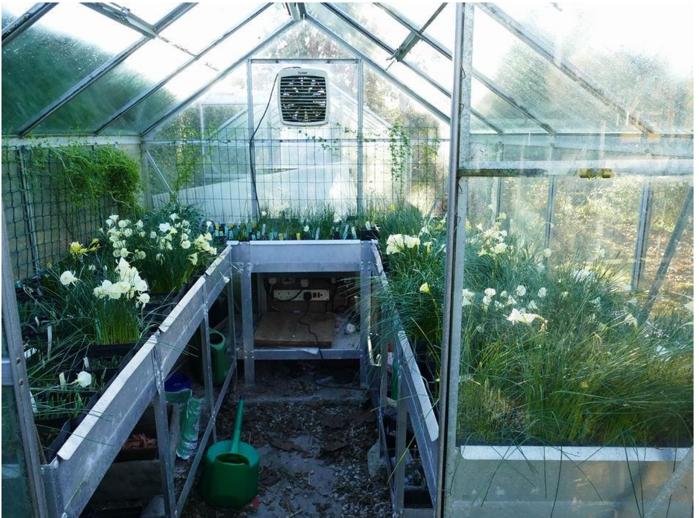
In the bulb house the Narcissus in pots are getting into flower now.