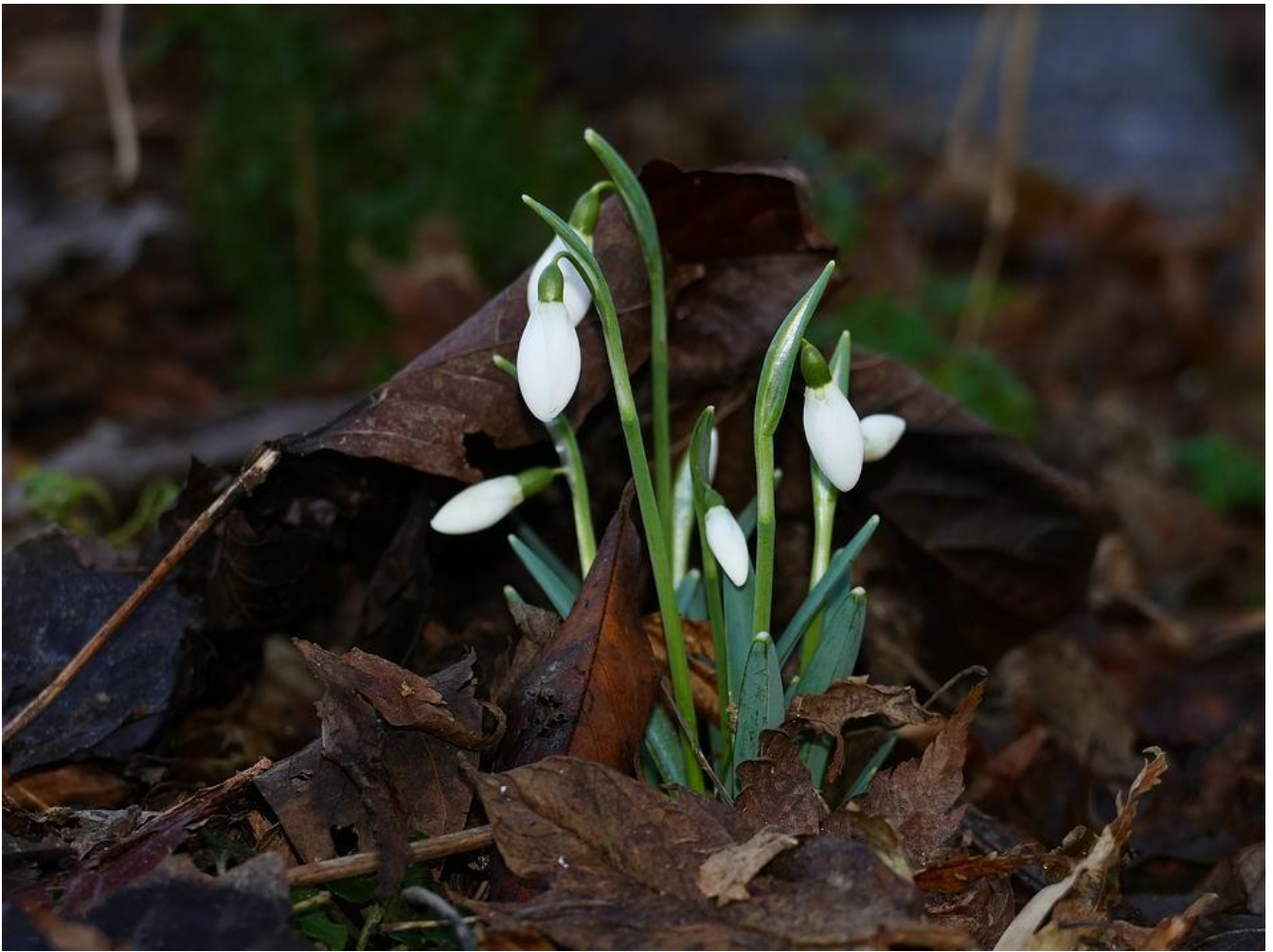
I am amused by this group pushing aside one of the larger leaves as they grow upwards into the light.