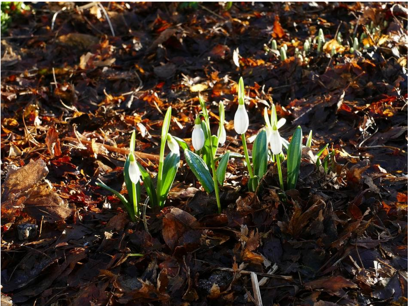
The low sunshine acts a bit like a spotlight casting strong dramatic light and shade across the beds picking out the emerging snowdrops.