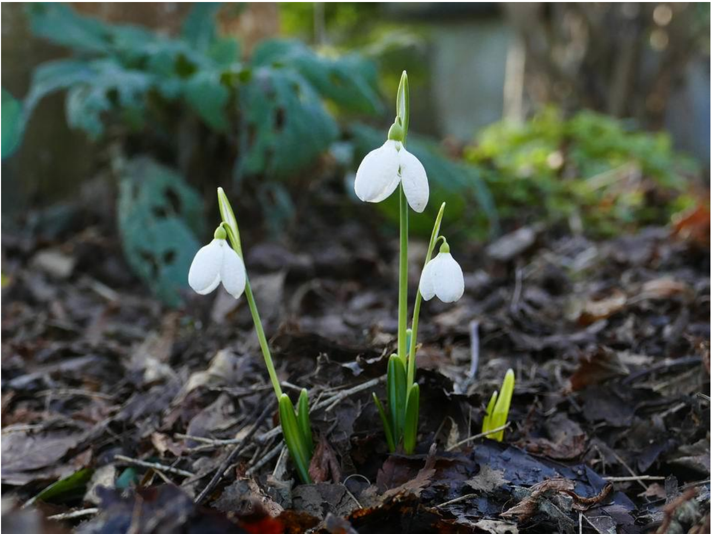
The air temperature is warm enough for the petals of some of the snowdrops to start opening.