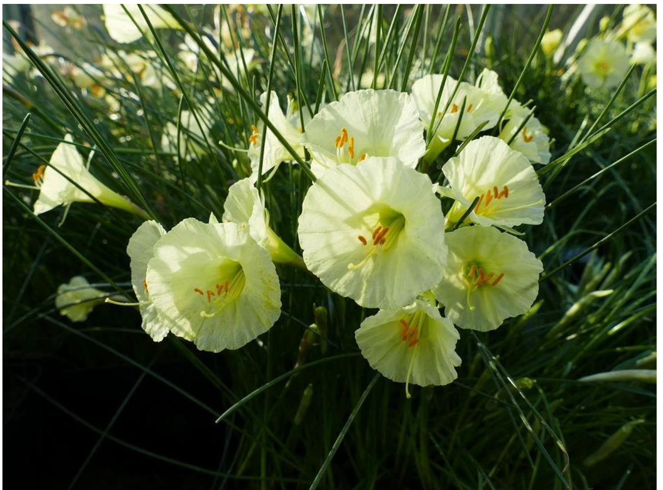
Narcissus 'Craigton Clumper' is a seedling I selected from Narcissus romieuxii .